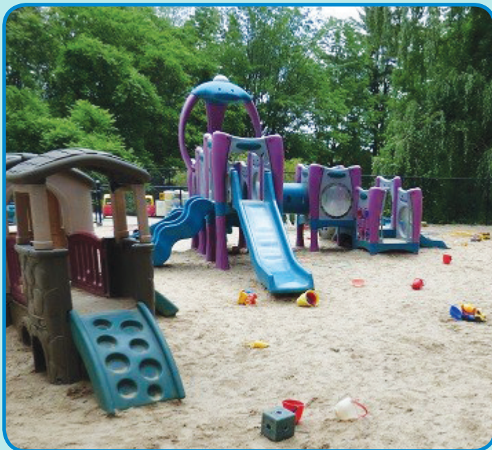
The Richard F. Blake Children's Center Outdoor Playground