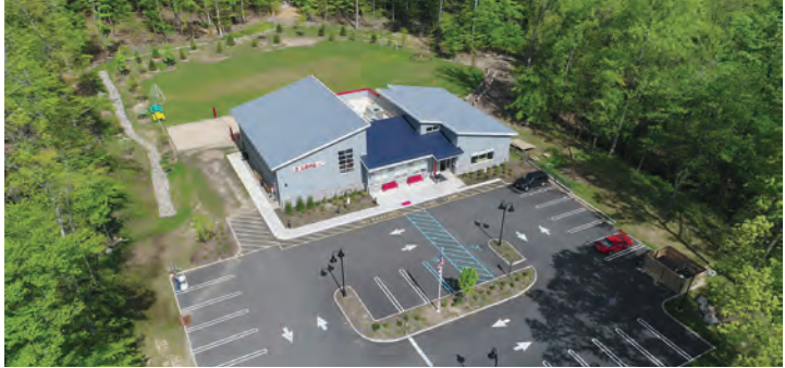
Ariel view of the Y-Zone Facility (6,000 sq. feet)