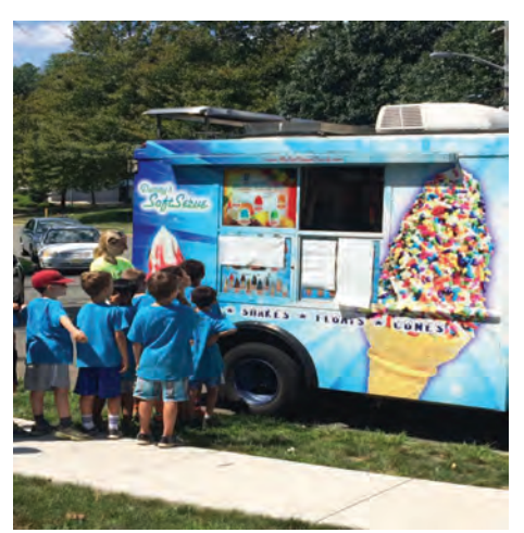
Ice cream truck!