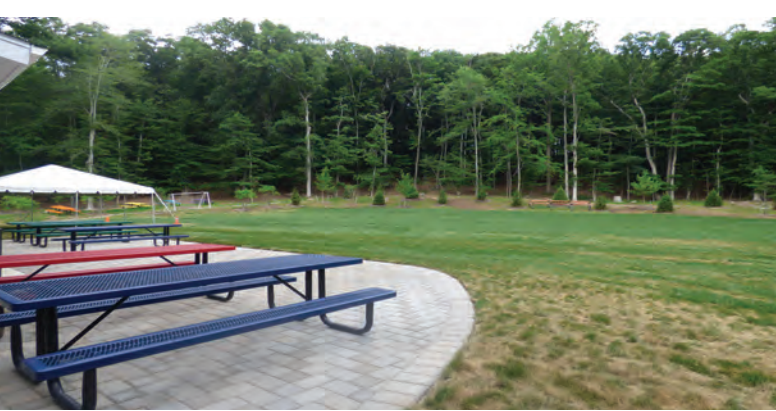
Outdoor View from the Patio (3 acres)