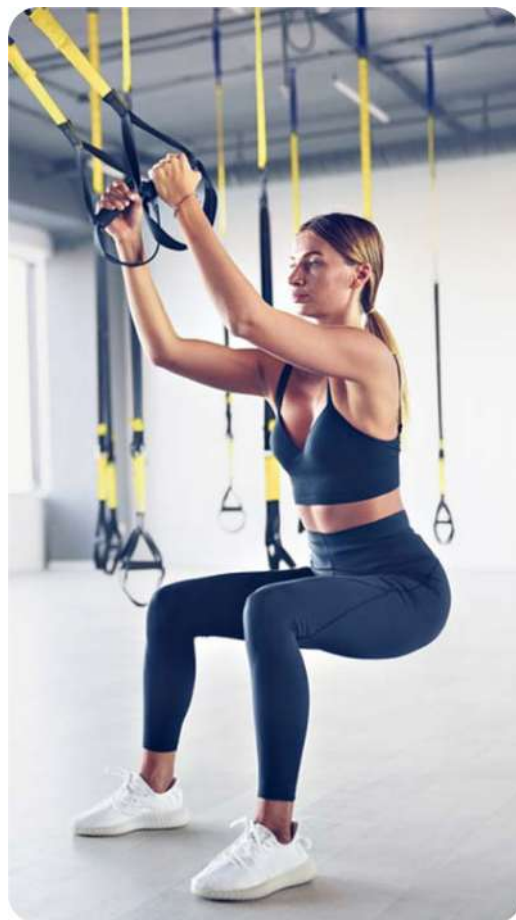
Below Photo: TRX® Demonstration

Fee: $75 for 3 sessions or $150 for 10 sessions